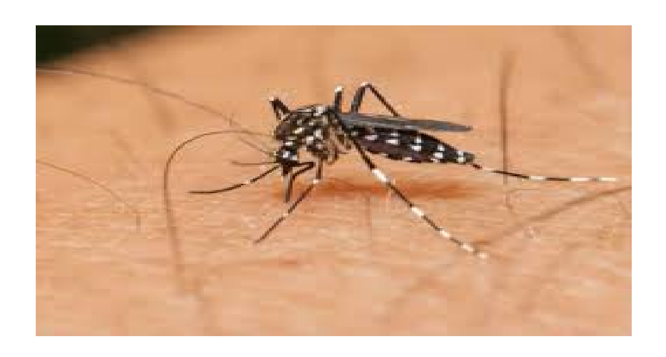
"TIGER Mosquitoes" Breeds Inside and around the House Bites in day time also